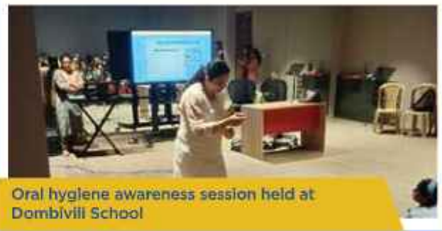
Oral hygiene awareness session held at Dombivili School