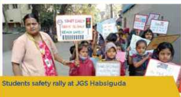
Students safety rally at JGS Habsiguda