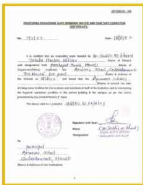
Hygiene and sanitisation Certificate Amanora