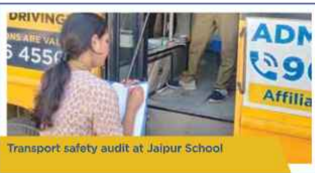
Transport safety audit at Jaipur School