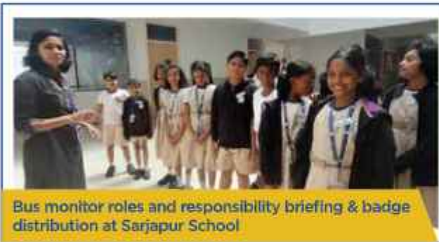
Bus monitor roles and responsibility briefing & badge distribution at Sarjapur School