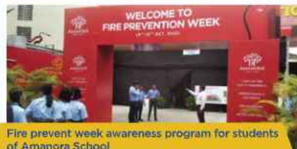
Fire prevent week awareness program for students of Amanora School