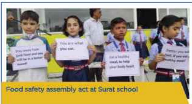
Food safety assembly act at Surat school