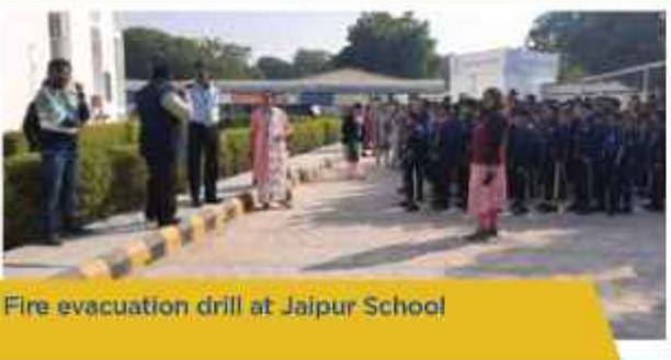
Fire evacuation drill at Jaipur School