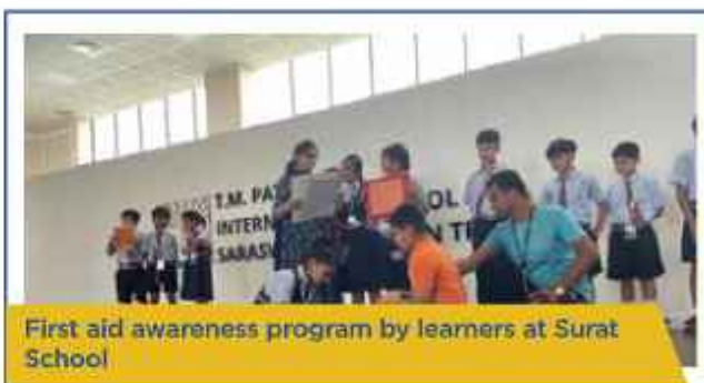
First aid awareness program by learners at Surat School