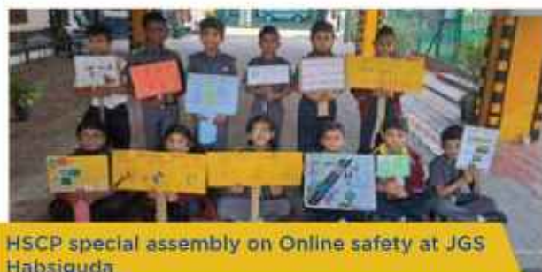
HSCP special assembly on Online safety at JGS Habsiguda