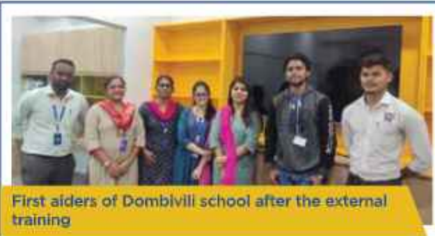
First aiders of Dombivili school after the external training