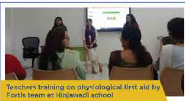
Teachers training on physiological first aid by Fortis team at Hinjawadi school