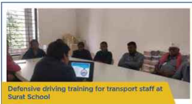
Defensive driving training for transport staff at Surat School