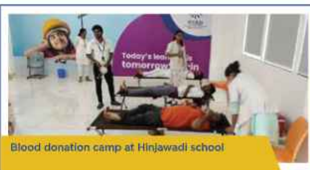
Blood donation camp at Hinjawadi school