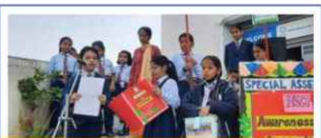
Special assembly on suggestion box usage awareness at Jaipur School