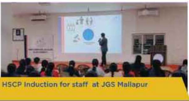
HSCP Induction for staff at JGS Mallapur