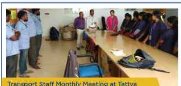
Transport Staff Monthly Meeting at Tattva School