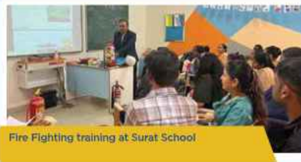
Fire Fighting training at Surat School