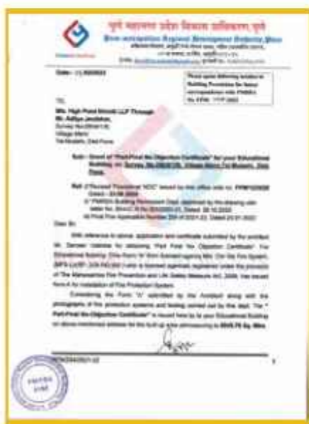
Fire NOC-Hinjawadi School