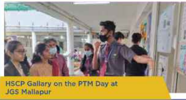
HSCP Gallery on the PTM Day at JGS Mallapur