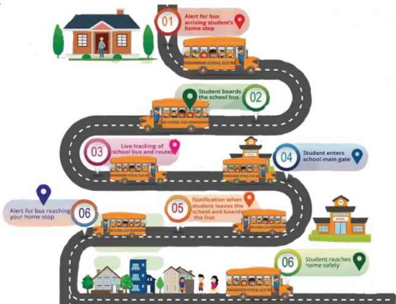
Infographics: school bus GPS tracking updates at various stages.

A number of safety issues faced by students travelling to the school by buses. The Supreme Court of India has directed a measure to mitigate this by making GPS and CCTV fitting compulsory in all school buses. GPS has been declared compulsory by Central Board of Secondary Education as well. GPS (global positioning system) is a network of satellites and receiving devices used to determine the real time location of the object (moving/non-moving) on the earth. GPS system installed in school bus helps mainly in real-time tracking of the school vehicle location & alerting over-speeding or route deviations by the driver /bus.