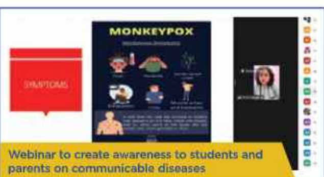
Webinar to create awareness to students and parents on communicable diseases