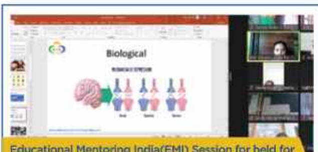
Educational Mentoring India(EMI) Session for held for teachers of JGS