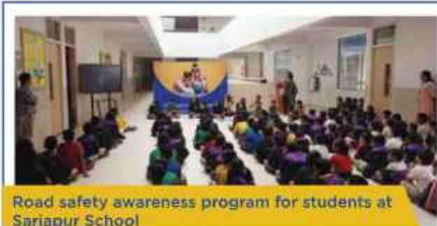
Road safety awareness program for students at Sarjapur School