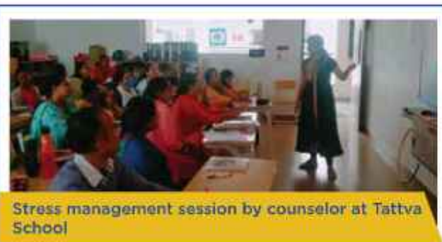
Stress management session by counselor at Tattva School