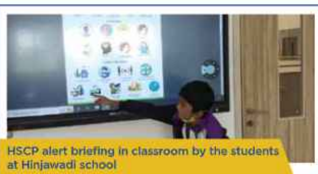
HSCP alert briefing in classroom by the students at Hinjawadi school