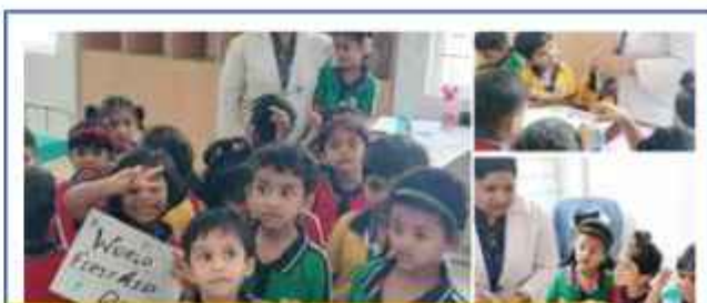
World First Aid Day awareness program at Sarjapur School