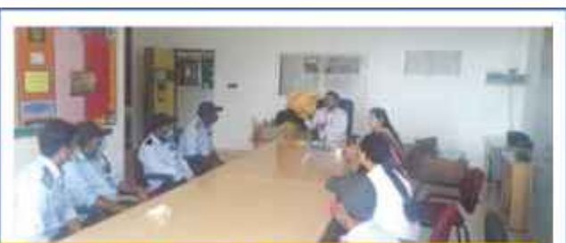
Security Staff Meeting at Tattva School