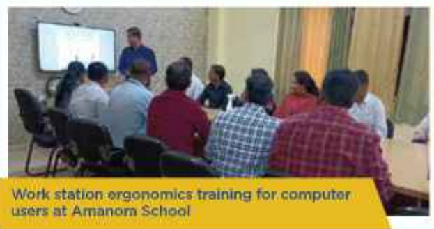
Work station ergonomics training for computer users at Amanora School