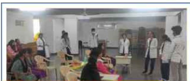
Dental campaign for teachers at Tattva School