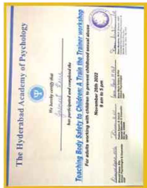
Body Safety workshop participation certificate for JGS School