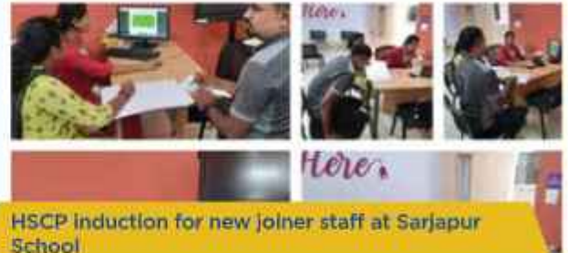
HSCP induction for new joiner staff at Sarjapur School