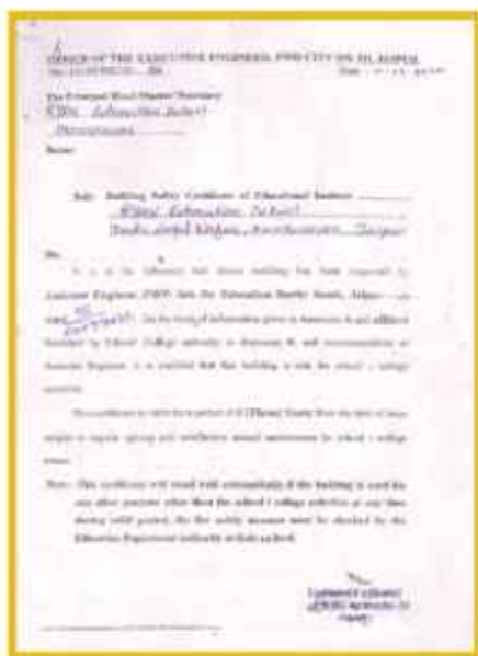
Building safety certificate of Jaipur School