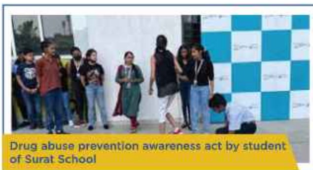
Drug abuse prevention awareness act by student of Surat School