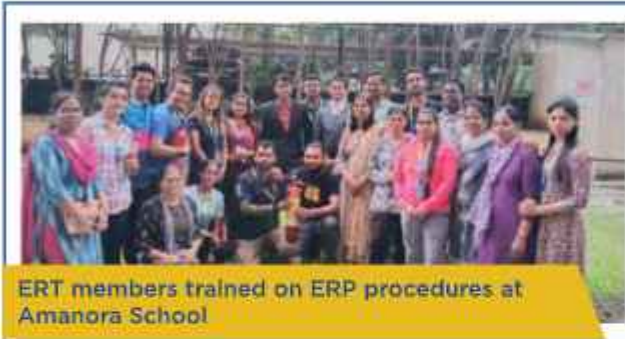
ERT members trained on ERP procedures at Amanora School