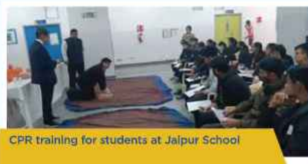
CPR training for students at Jaipur School