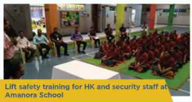
Lift safety training for HK and security staff at Amanora School