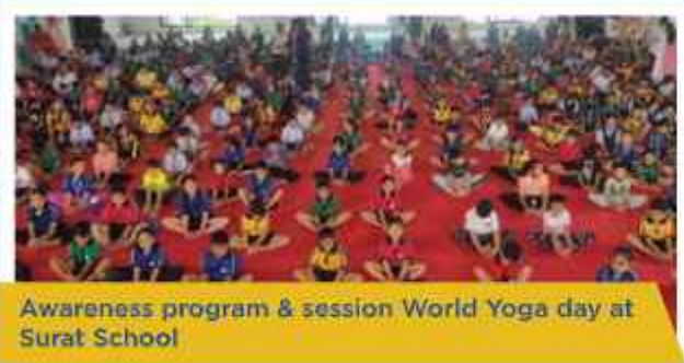
Awareness program & session World Yoga day at Surat School