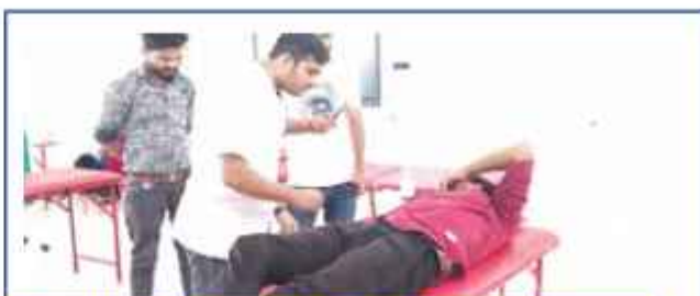
Blood Donor Camp at Dombivili School