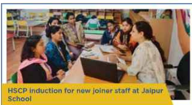
HSCP Induction for new joiner staff at Jaipur School