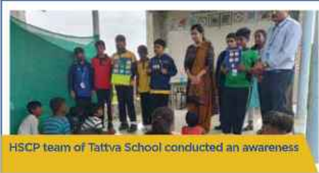
HSCP team of Tattva School conducted an awareness