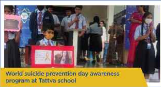
World suicide prevention day awareness program at Tattva school