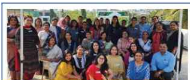
Teachers of JGS participated in My Body Safety Workshop