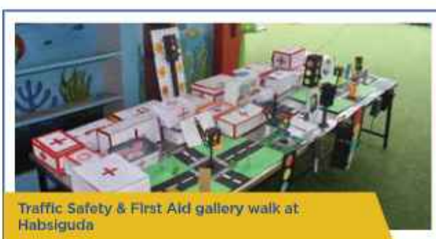
Traffic Safety & First Aid gallery walk at Habsiguda