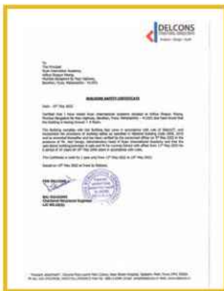
Building safety certificate of Bavdhan School