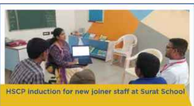
HSCP induction for new joiner staff at Surat School