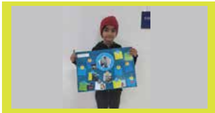
Hanvik S - Prep II

Star of the Week is one of the best ways to get to know our students on a more personal level. Students feel distinct for a full week, which encourages classroom community.